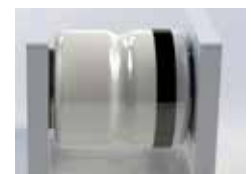
Surface Mount Package